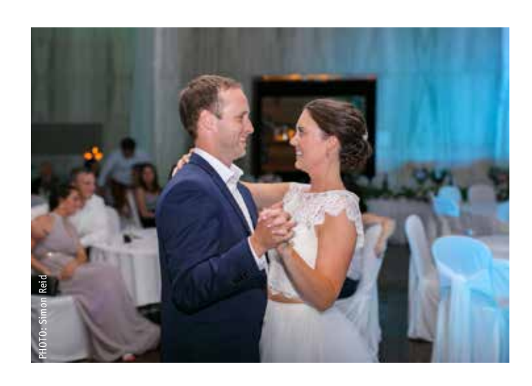
Make unforgettable memories in the grand hall