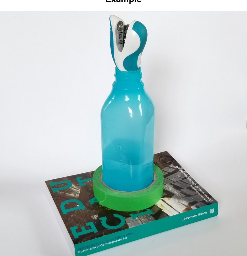
Tableau: A group of models or motionless figures that represent a scene from a story.

Readymade: A sculpture created from already existing objects that have been either altered slightly or are presented in a different way.