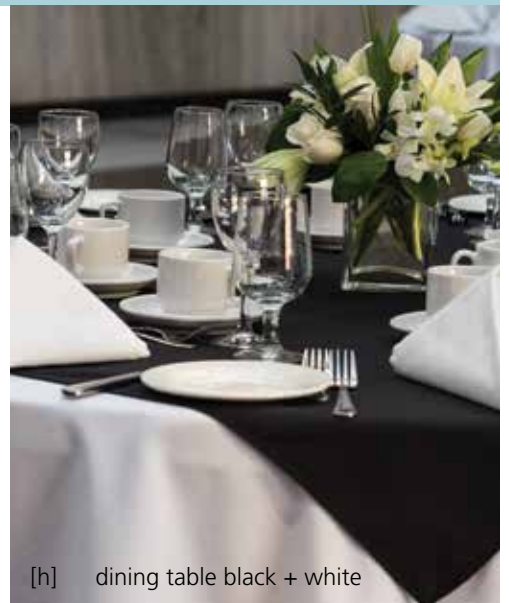
[h] dining table black + white