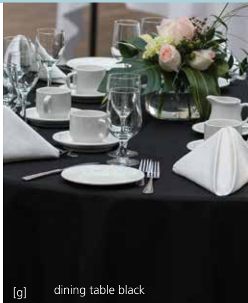
[g] dining table black