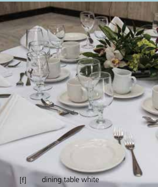
[f] dining table white